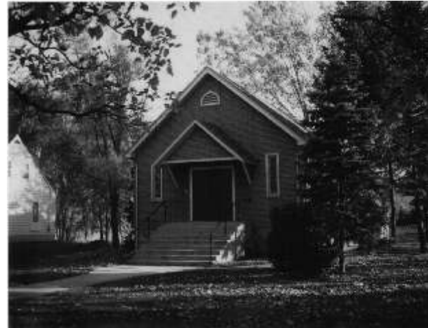
Christ Our Savior's first church building as a mission church in Winfield.