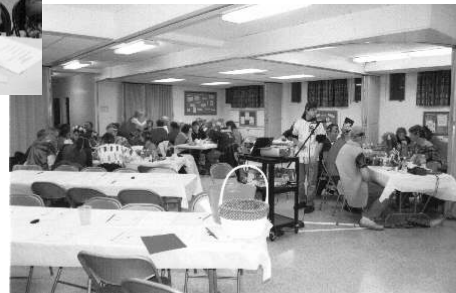
Members and friends exercise their mind power while having fun in the 'Battle of the Minds' fundraising event.